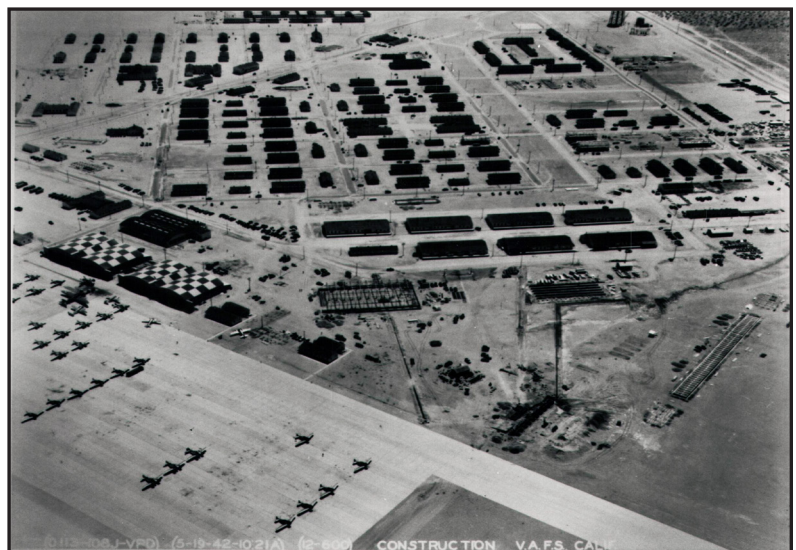
Victorville Army Air Field in 1942

Today, much of the military property has been transferred to the local community and is in various stages of redevelopment.